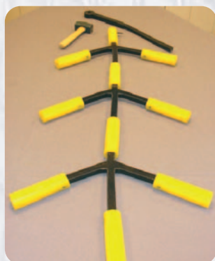
Connection of elements