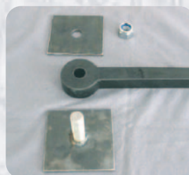
Welding of the fixing plate at the top of the screen frame