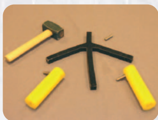
Setting of each element